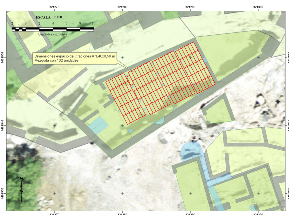
Figure 3: Diagram of the distribution of individuals in the Mosque of the Qasb in the fourth prayer position.

In this way the number of individuals who could gather in this space would be 132, and may be assumed to reside in the Qasb.